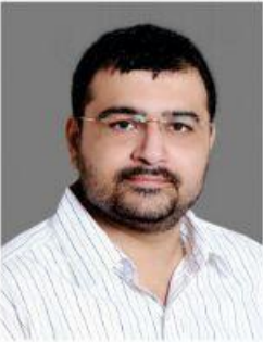
Hardik Panchal HARDY SMITH

Digital printing on PVC WPC boards is just a unique – easiest process for high resolution printing over any substrate. PVC sheet doesn't need any pre-treatment of surface while printing. You can just print is like a paper. Inkjet flatbed printers available in the market performs well for this value addition and prints really classic quality. Be it a human image or a natural art piece, a modern art or an old memorable family image, a painter's master piece or a children's interest – you can all print on this surface, perfectly. MDF or Wood needs surface finishing and treatment, which PVC sheet doesn't need. You can use Digiprint PVC foam sheets for Doors, wardrobe shutters, kitchen shutters, bookshelf shutters, wall decoration, office places and lot more. Further, applying a coat of PU or melamine for high gloss or mat finish can make your shutter or door a high quality and long lasting product for several years. Digital printing on PVC foam sheet gives several smart creations for architects. You can imagine your ceiling with an image of birds flying in sky or dense garden with flowers or sky shining with stars and moon!, just with digital printed PVC sheets. Try it!